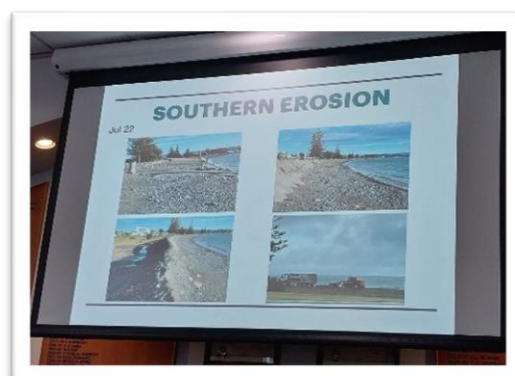
Erosion effects at Westshore