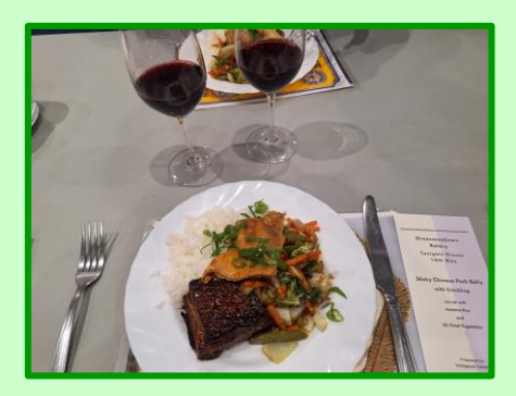
Sticky Chinese Pork Belly