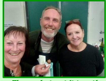
Them what put it together