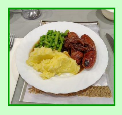
Bangers & Mash